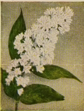
Deutzia—Pride of Rochester

DEUTZIA, PRIDE OF ROCHESTER. Fast-growing. Masses of pink-tinged flowers. 2 to 3 ft., $1.00 each; 3 or more, 90c each. 3 to 4 ft., $1.50 each; 3 or more, $1.35 each. 4 to 5 ft., $2.00 each; 3 or more, $1.85 each.